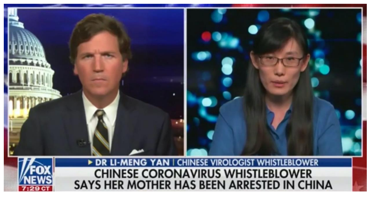
Figure 4. Dr. Yan interviewed by Tucker Carlson on Fox News on Oct 6th, 2020.

It is not exaggerating to state that, by publishing our reports and thereby confronting the CCP government, we have practically assumed the role of whistleblowers. How whistleblowers and/or protestors are treated by the CCP is no secret – plenty of examples can be found in the Hong Kong protests. What happened to Dr. Yan's mother recently is another example and probably more suggestive than others in this case (Figure 4). Clearly, using pseudonyms was a mechanism to provide a layer of protection for the three co-authors and their families back in China . The lack of compassion of the CNN reporters here is shameful and mirrors the mentality of the communist dictators, which in a way spells out the underlying connection between them.