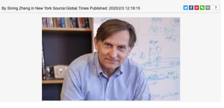
Figure 6. The CCP government gave the highest awards to Dr. Lipkin in <u>2016</u> (top left) and in <u>2020</u> (top right), who had then praised China for its management of the pandemic (<u>bottom</u>).

Such a high-level of engagement between a western expert and the CCP government is not common but also not unprecedented. When it happens, however, bribing of the foreign expert by the CCP government is frequently involved, where money, fame, and various other benefits would be provided by the CCP government in exchange for the foreign person's expertise and/or influence.